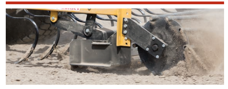
Every MK Martin Track Curry comes with two standard spill plates. These funnel any excess material into the Track Curry's path, ensuring your arena or track keeps looking its best.